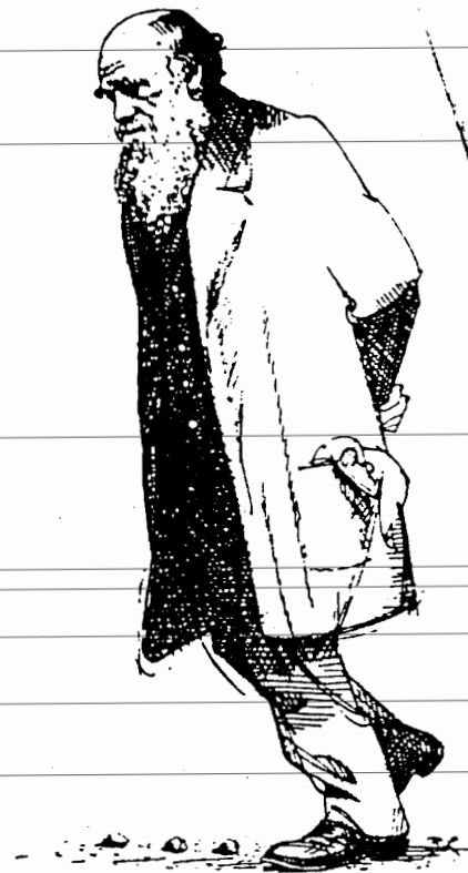
Figure 3. Charles Darwin engaged in the arcane and almost lost art that today we would label thinking.

If you can't walk, try running. I have been a recreational jogger for 15 years. I sometimes find that a pain in my ankle that I feel when walking or jogging will go away if I switch to a sprint. This cure suggests a strategy to overcome writer's block, which afflicts many scientists. The scenario I often observe is that someone finishes an experiment or field study and then sits down to "write up the results." It reminds me of the Peanuts comic strip in which Snoopy is trying to write a great novel and keeps getting stuck on "It was a dark and stormy night."