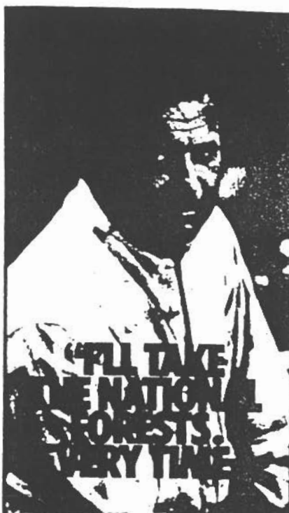
Robert Conrad for America's National Forests

When it comes to enjoying America's Great Outdoors, I'll take the National Forests.